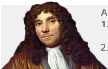
Antoni van Leeuwenhoek