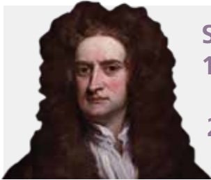
Sir Isaac Newton

As you read pages 19–20, write two things you learn about each scientist on the chart. Add these men to your timeline. Then complete On Your Own questions 1.7.